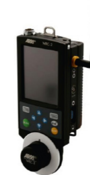
WRC-2, WMU-3, WBU-3