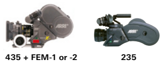
435 + FEM-1 or -2 235

ARRIFLEX 416, 416 Plus HS, 416 Plus, 16SR3, 235, 535, 535B, 435 with FEM1 or FEM2, D-21, D-21 HD