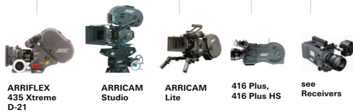
ARRIFLEX 435 Xtreme D-21