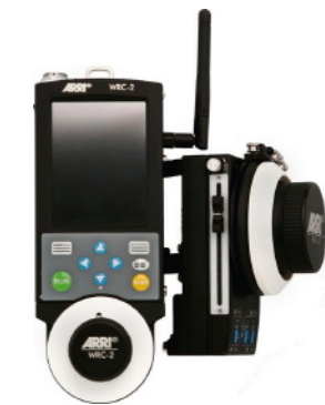
WRC-2, WMU-3, WEB-3, WFU-3, WBU-3