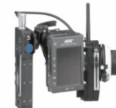
WBU-3, WMU-3, LDD-FP WEB-3, WFU-3, ZMU-3A WZB-3