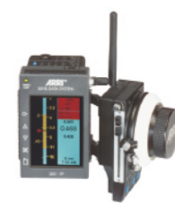
WBU-3, WMU-3 WFU-3 WEB-3, LDD-FP