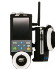
WRC-2, WMU-3 WEB-3, WFU-3 WBU-3