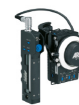
WBU-3, WMU-3 WFU-3, ZMU-3A WZB-3