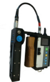
ZMU-3A, WCU-3 (for bracket and cable please see overview WIRELESS REMOTE SYSTEM „mech. accessories“)