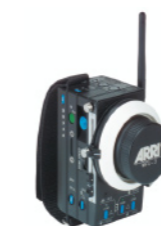
WBU-3, WMU-3 WZU-3, WFU-3