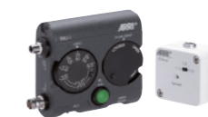
ESU-1 External Sync Unit