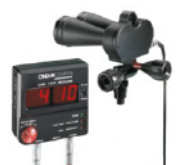
Cine Tape Measure