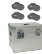
Case for four 60m/200ft 235 Shoulder Mags K2.65047.0