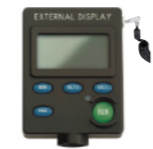
External Display EXD-1 , K2.55013.0, (incl. cable KC-100 S 0.8 m / 2.7 ft, K4.65207.0) KC-122 S 20 m / 66 ft, K2.65067.0