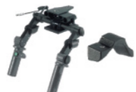
Shoulder Set ARRICAM Studio/Lite incl. Shoulder Pad K2.54023.0