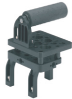
235 Low Mode Support LMS-1 K2.55014.0