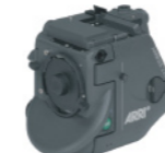
Arriflex 235 Body 4P K1.55000.0 3 perforation conversion kit K4.65170.0