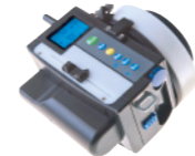
Wireless Control Unit WCU-3 K2.65155.0