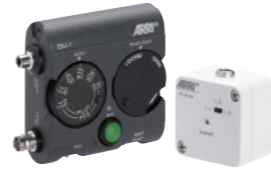
External Sync Unit ESU-1 , K2.46006.0 Cables KC-32 & KC-33 and pickup box included