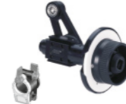
Lightweight Follow Focus Set LFF-1 K0.60021.0