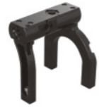
235 Low Mode Handle LMH-1 K2.55006.0