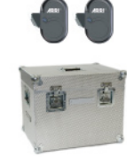
Case for two 120m/400ft Steadicam Mags K2.65050.0