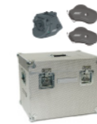
Case for 235 and two 60m/200ft 235 Shoulder Mags K2.65004.0