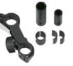
Console CLM-2 K2.52035.0