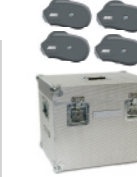
Case for four 120m/400ft 235 Shoulder Mags K2.65005.0