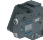
Arriflex 235 Body 3P K1.55000.3 4 perforation conversion kit K4.65226.0